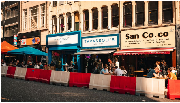
New Briggate