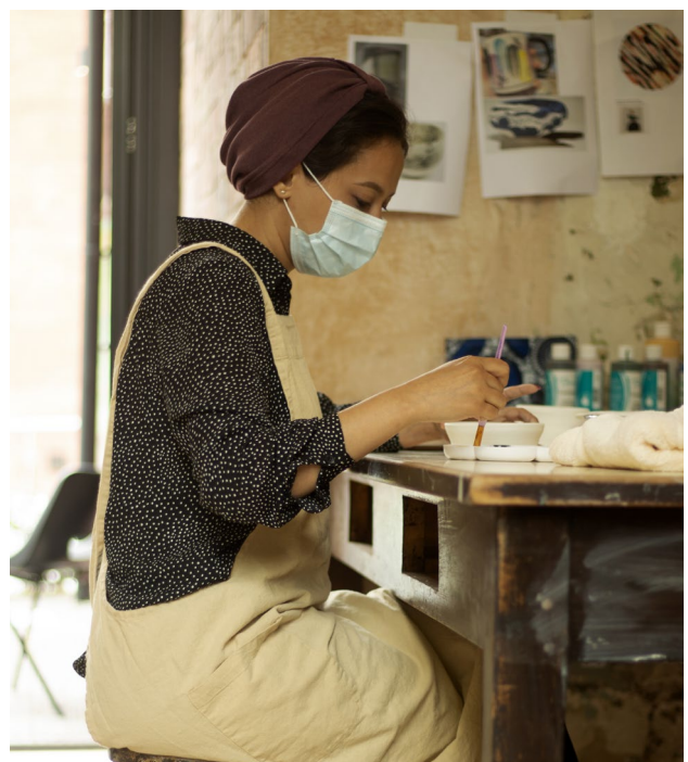
Clay workshops, 2021

This could include events such as the reintroduction of Leeds West Indian Carnival to New Briggate. Oral History inspired 'Sound Stops' in place of the bus stops (which are to be moved as part of the physical programme). 'Take-Away Art' from the main take-aways on the street, outdoor theatre, music and film. We don't know exactly what these events will look like yet as activity will be co-created and defined by the community through the initial engagement and participatory work.